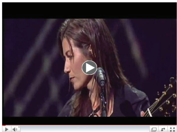
Michael W. Smith & Amy Grant - Thy Word - [Live]