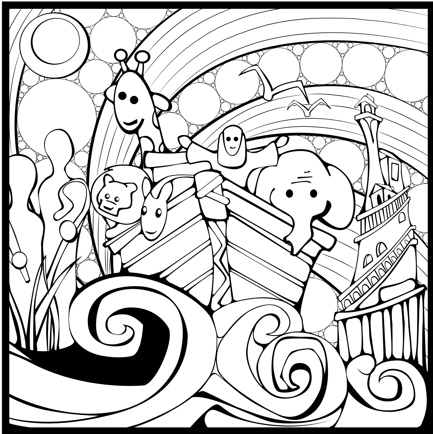
THE SIGN OF THE COVENANT 🌈 Genesis 9:12-13